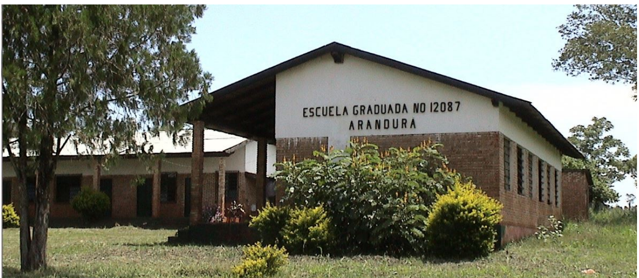
Paso-Cadena School in 1986